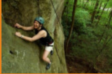
Rock climbing in the gorge has increased in popularity.

Located on the rim of the country's newest national park, AOTG is an adventure outfitter offering a wide array of outdoor activities such as whitewater rafting, rock climbing, water sports, aerial adventures and more. Additionally, the resort accommodations and restaurants as well as retail, gift and gear shops.