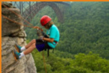
Rock climbing has become an increasingly popular adventure.