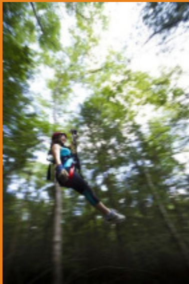
With multiple aerial activities, Adventures on the Gorge offers options including ziplines, ropes course and Bridge Walk.