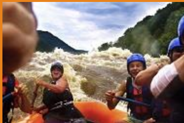
Adventures on the Gorge offers multiple rafting experiences on the New and Gauley Rivers.

choices ranging from one-bedroom cabins and suites to four-bedroom cabins. All offer private entrances and wi-fi, and most have their own bathrooms. Several have washers and dryers. The multi-bedroom cabins feature kitchens with ovens, stoves, refrigerators and dishwashers. This is especially appealing to groups who make mealtime part of their entertainment or who want to save on dining expenses.