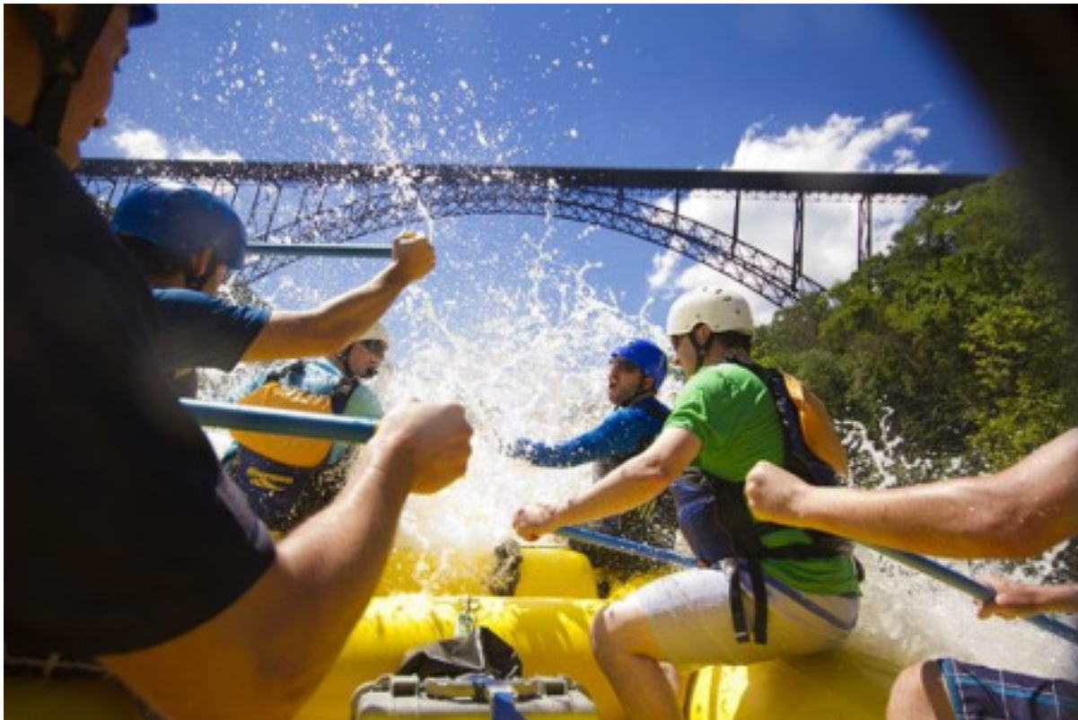
Adventures on the Gorge offers an array of adventures including whitewater rafting on the New River.