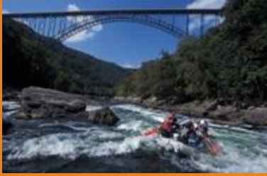
The Lower New River is the most popular run in the state.