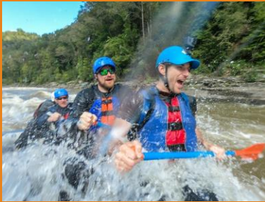
The Gauley River features 97 named rapids.

experience from day to day, rafters can sign up for a trip and let us choose the trip.”