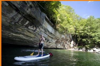
Stand up paddleboarding...