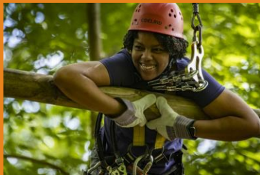
TimberTrek Adventure Park...