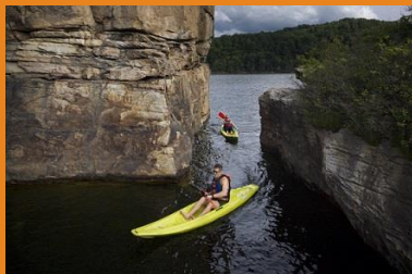
and flatwater kayaking.