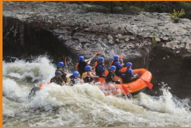
Pillow Rock is one of several notable Gauley rapids.

Release dates this year are Sept. 9-12, 16-19, 23-26, Sept. 30-Oct. 3 and Oct. 7-10 and 15-16.