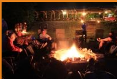
The Gauley Overnight features camping after a day on the Upper Gauley.