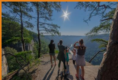
Hikers are rewarded with river views.