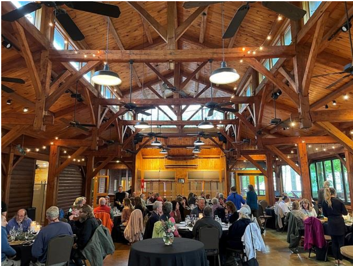
Freelance Council members met for dinner in Smokey's at Adventures on the Gorge.