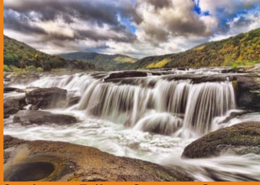
Sandstone Falls in Summers County was featured in various tours.