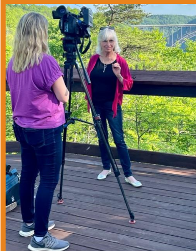
Media coverage for the SATW Freelance Council meeting included more than 80 articles, numerous broadcasts and countless social media posts.