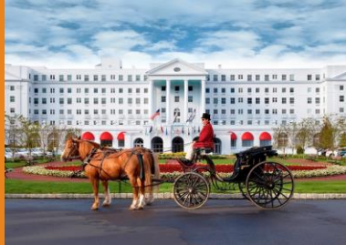
The Greenbrier hosted the opening night reception.

group conference center. Visitors can choose from a variety of accommodations and vacation packages .