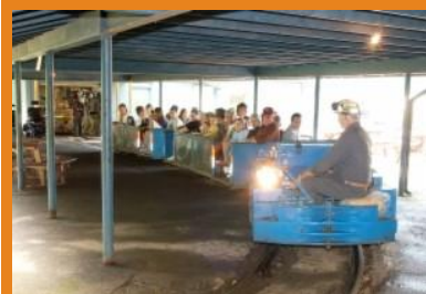
Partner support included a tour of Beckley’s Exhibition Coal Mine.