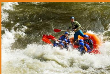
The Gauley River is known for its predictable big waves in September and October.

Rafting begins on the Lower New April 1. Guided trips on the Upper New commence May 25. Spring and summer Gauley rafting is sporadic and occurs when U.S. Army Corps of Engineers releases water from Summersville Dam. In September and October, releases are scheduled Fridays through Mondays beginning the first Friday after Labor Day.