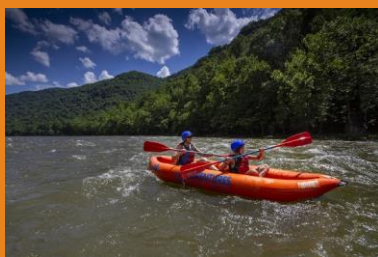
The Upper New River is perfect for novices and kids as young as six.