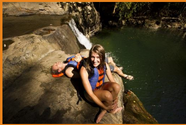
Glade Creek features smooth water and swimming holes.