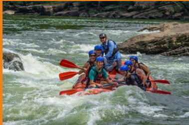
The Lower New River put West Virginia rafting on the map.