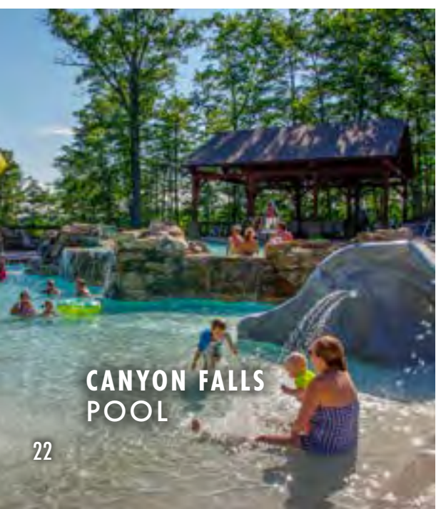
CANYON FALLS POOL