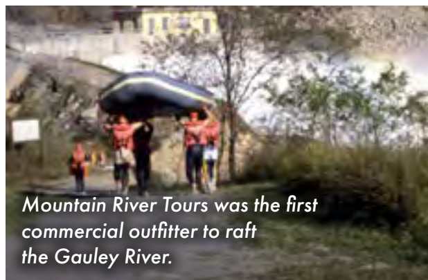
Mountain River Tours was the first commercial outfitter to raft the Gauley River.