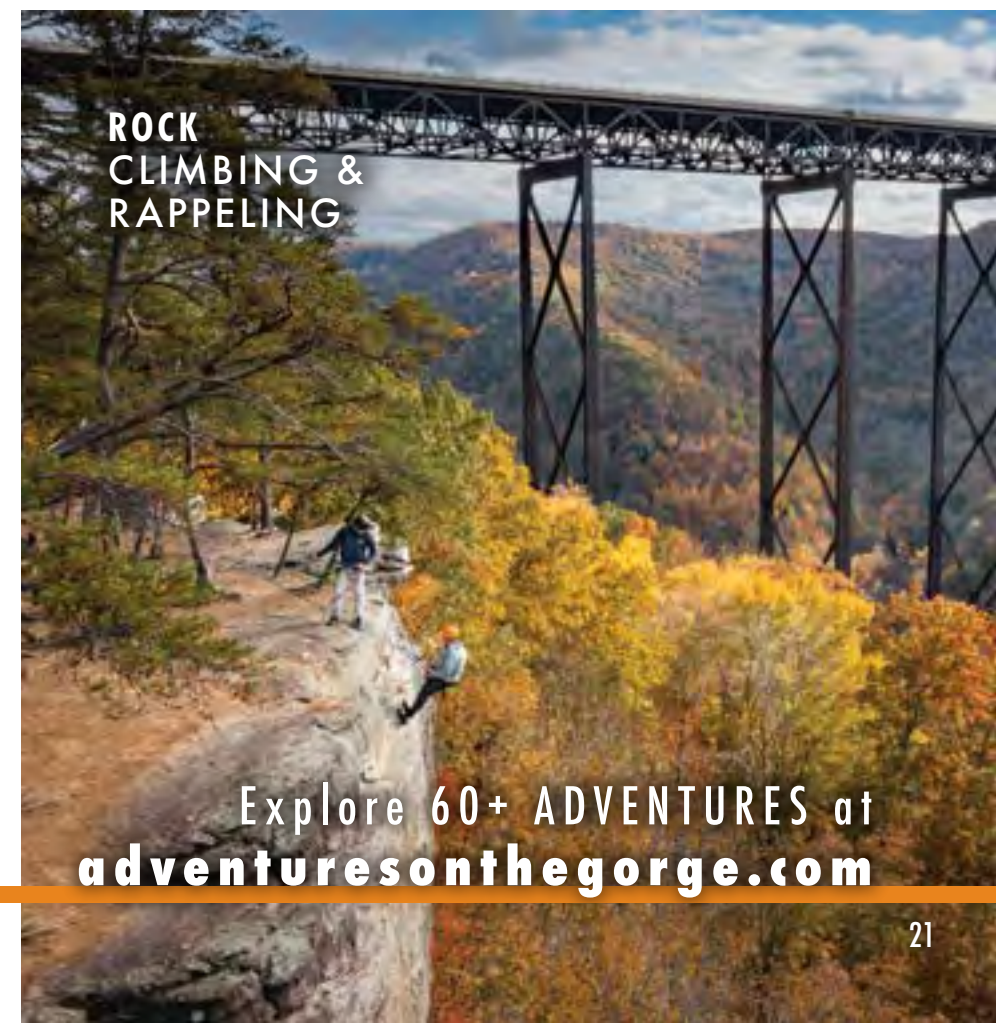
ROCK CLIMBING & RAPPELING

Explore 60+ ADVENTURES at adventuresonthegorge.com