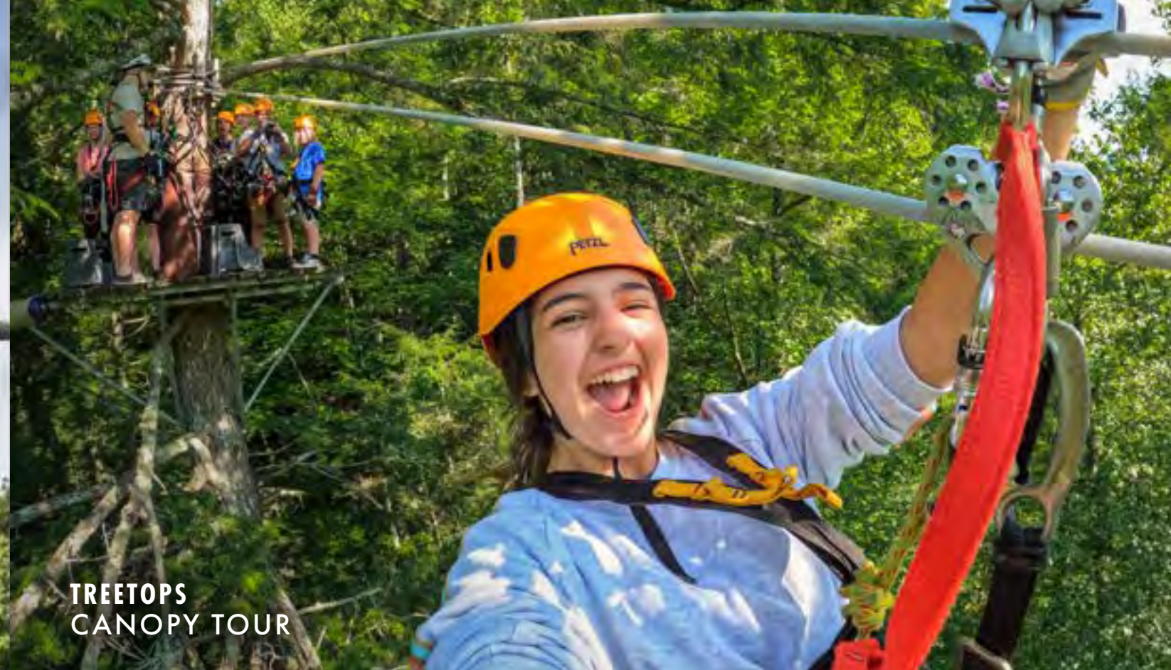
TREETOPS CANOPY TOUR