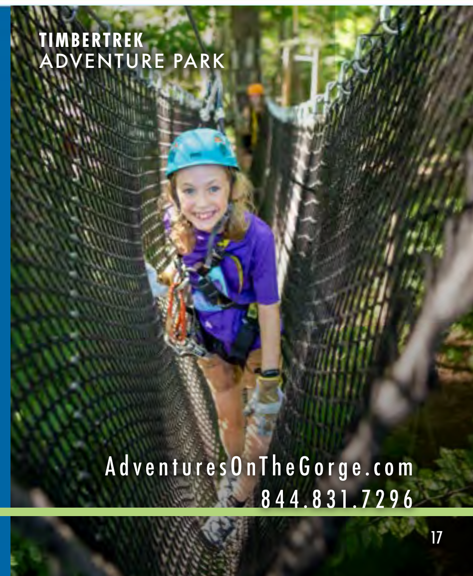
TIMBERTREK ADVENTURE PARK

Choose your level of difficulty on this self-guided adventure with 7 courses to tackle! Min Age: 4