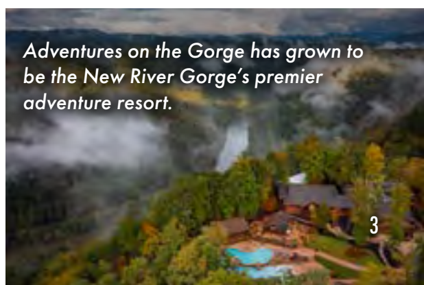
Adventures on the Gorge has grown to be the New River Gorge's premier adventure resort.