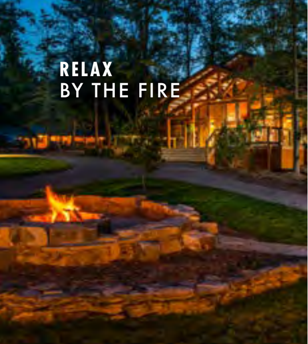
RELAX BY THE FIRE