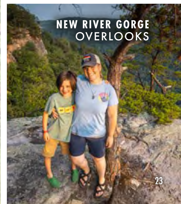
NEW RIVER GORGE OVERLOOKS